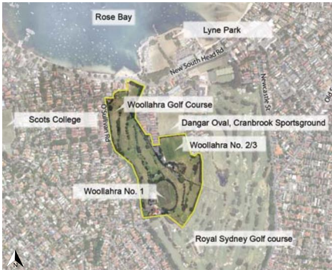
Figure 2: Location of Woollahra Park within Woollahra (Woollahra Park Plan of Management)