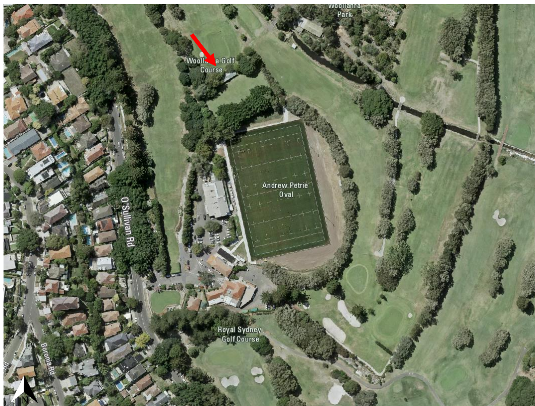
Figure 3: Location of the Croquet Club within Woollahra Park with Croquet Club indicated with arrow (Woollahra Council GIS)