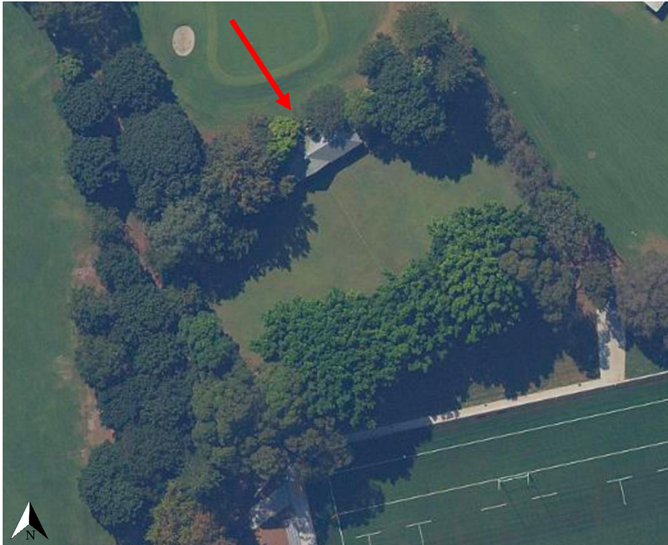
Figure 4: Aerial photograph over the clubhouse and lawns with club house indicated with arrow